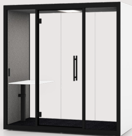
Table Height adjustable table with white antibacterial laminate Power outlets Additional 110-240 V power outlet on the wall Screen bracket universal bracket with cable management (optional)

Workstation Turn privacy into productivity with Duo Workstation